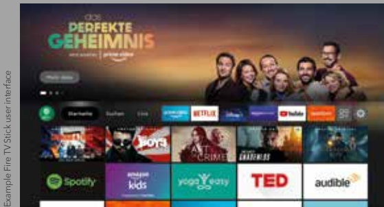
Example Fire TV Stick user interface

Experience films and series with Netflix, Prime Video or Disney+: with an inconspicuously placed external solution for VoD services, this and much more content is available to you – ultra-fast in UHD. Thanks to sophisticated integration, you can enjoy full control of TV streaming solutions such as Apple TV, Google Chromecast or the Amazon Fire TV stick with your Metz remote control via HDMI-CEC and integration into the TV menu structure. Practical and sustainable: