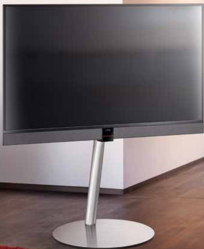
/ Example Cubus on the elegant stand rack