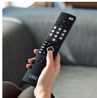
The clear RM18 remote control in black is matched by the clearly arranged menu.