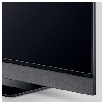
Graphite grey acoustic fleece with brilliant black brushed aluminium trim and surround.