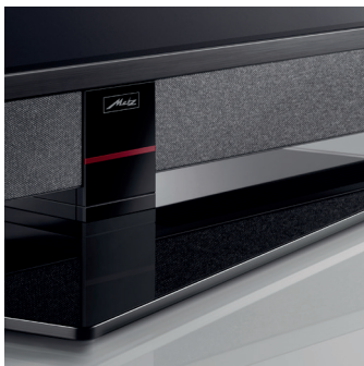
A beautifully shaped, rotating black glass stand gives it a stable base.

The CUBUS promises a remarkably sharp viewing experience thanks to its direct LED display in HD resolution and 400 MetzVision technology. Local area dimming optimises the contrast and helps make the television more energy efficient. A twin multi-tuner and two CI+ interfaces equip it to receive free and pay TV via all available reception modes. A sealed 2-way system and bass reflex channel mean MetzSoundPro technology will deliver crystal clear trebles and rich bass frequencies that bring sound to life through six front-facing speakers. WiFi, Bluetooth® and an extensive range of interfaces make it a truly versatile all-rounder. Thanks to its comprehensive USB recording function, this TV reaches its full potential when an external data medium with timeshift and recording functions is connected to it.